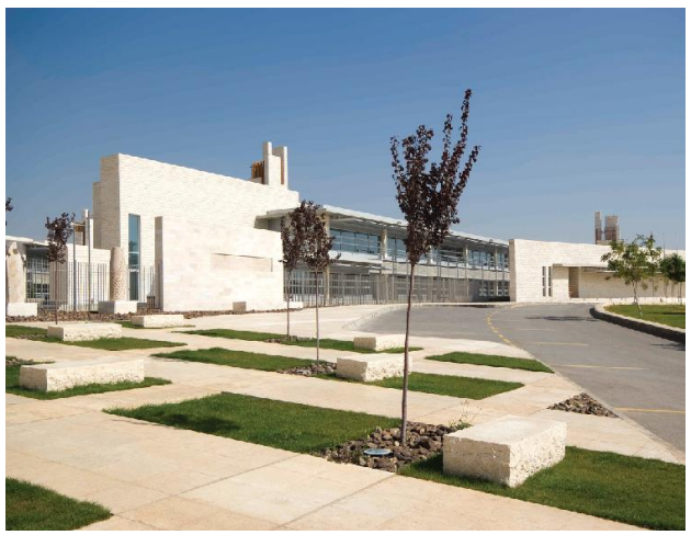
"The International Academy, Amman", <u>www.conexjo.com.2019</u>, https://www.conexjo.com/portfolio/the-international-academy-amman/