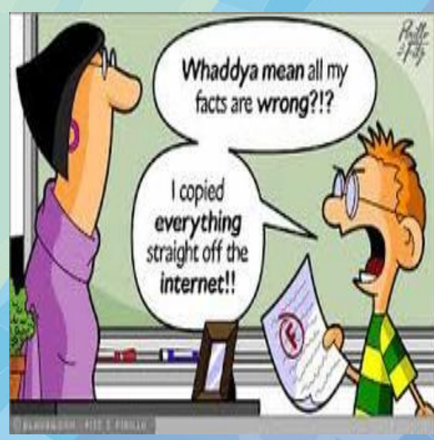
Summary, Paraphrase, or Quote