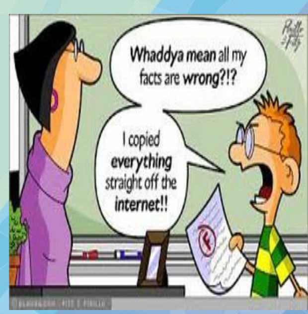
Summary, Paraphrase, or Quote