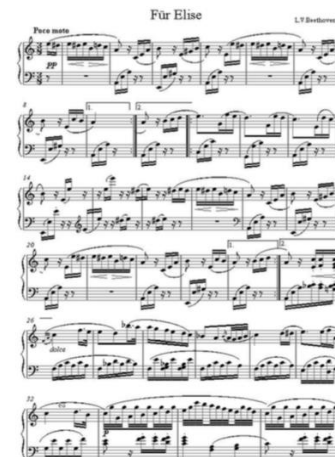
Figure 2: Fur Elise Sheet Music (Paterson)