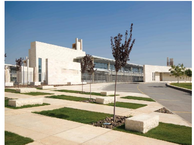
"The International Academy, Amman", www.conexjo.com , 2019, https://www.conexjo.com/portfolio/the-international-academy-amman/