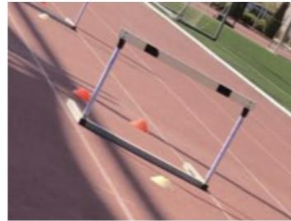
Figure 1: Track and Field Hurdle

Can new knowledge change established values or beliefs?